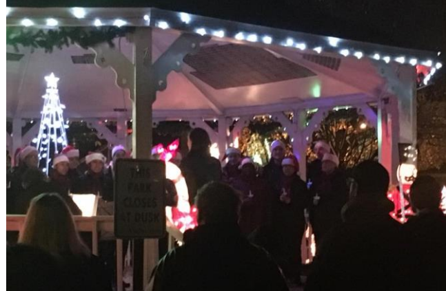
Kenmore Tree Lighting December 2, 2017 Shadyside Park Pavilion

36 th Annual Holiday Tree Festival presented by: the volunteers of Akron Children's Hospital. Every year, more than 200 decorated trees, 85,000 strings of lights and other holidays creations are displayed at the John S. Knight Center to benefit Akron Children's Hospital. Summit Choral Society's SCS's Performance and Advanced Choir are proud to sing at this annual event.