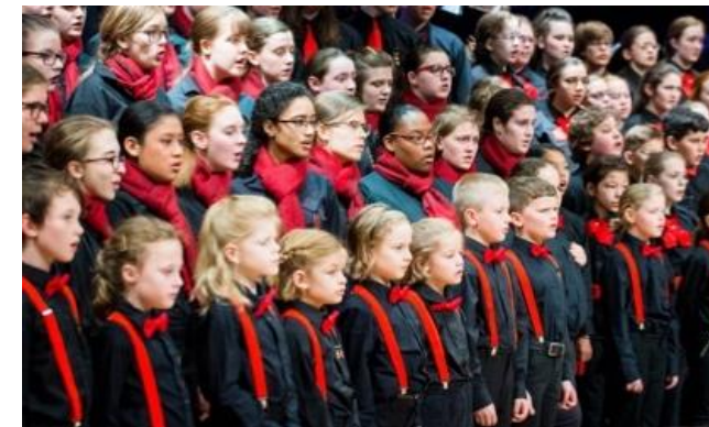
Sounds of Spring May 12, 2018 The Auditorium at Cuyahoga Falls H.S.

SCS's Performance Choir sang by auditioned invitation at the National Youth Choir Festival, Carnegie Hall, NYC! SCS's Performance Choir has the distinct honor of gracing the stage at Carnegie Hall as the prominent choir. While in New York as participants in the National Youth Choir Festival, these children enjoyed seeing Plácido Domingo in Verdi's Luisa Miller at the Metropolitan Opera, experience a Broadway performance of Hello Dolly starring Bernadette Peters at the Shubert Theatre, and sing at St. Malachy's - The Actor's Chapel. Congratulations to these talented local singers!