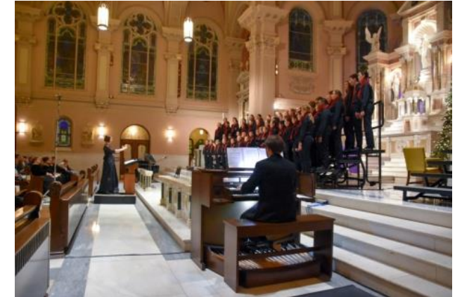
Christmas Candlelight Concert Series December 15, 16, 17, 2017 St. Bernard Church, Downtown Akron

Summit Choral Society's Children's Choir Program annual holiday concert. Performing Choirs included: Beginning Singing, Intermediate, Advanced, Performance, Musicals, Broadway, Boyz Choir, and Singers and Standards Choirs - as well as featured soloists! Filled with new and old holiday favorites this concert concluded with beloved choral selections from The Polar Express! "A concert that enhances the holiday season!"