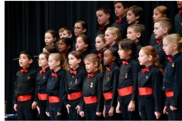
A Concert for the Holidays December 3, 2017 The Auditorium at Cuyahoga Falls H.S.

The Kenmore Events Committee presents: Summit Choral Society's Performance Choir at the 19 th Annual Kenmore Holiday Celebration Christmas Tree Lighting Ceremony held in at the Shadyside Park Pavilion in Kenmore, OH. Local area resident's enjoyed an evening of beautiful songs, traditional carols and holiday festivities, as the tree and lights were lit for the season.