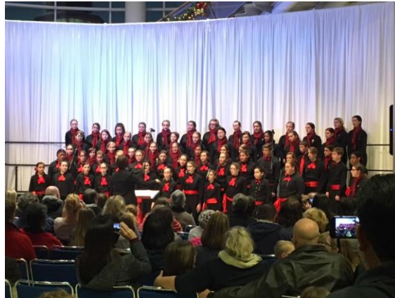
Akron Tree Festival November 19, 2017 John S. Knight Center

36 th Annual Holiday Tree Festival presented by: the volunteers of Akron Children's Hospital. Every year, more than 200 decorated trees, 85,000 strings of lights and other holidays creations are displayed at the John S. Knight Center to benefit Akron Children's Hospital. Summit Choral Society's SCS's Performance and Advanced Choir are proud to sing at this annual event.