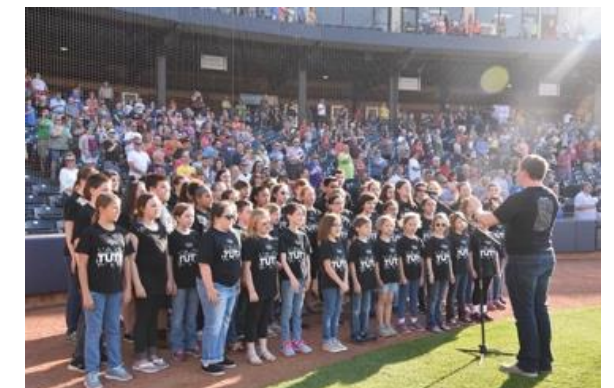
Akron RubberDucks May 25, 2018 Canal Park