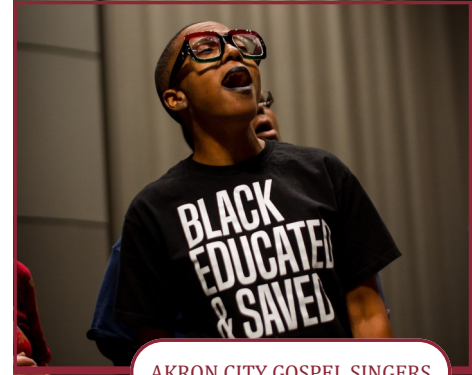
AKRON CITY GOSPEL SINGERS

Summer Music Camps are one-week camps for school age children that explore a variety of musical themes.