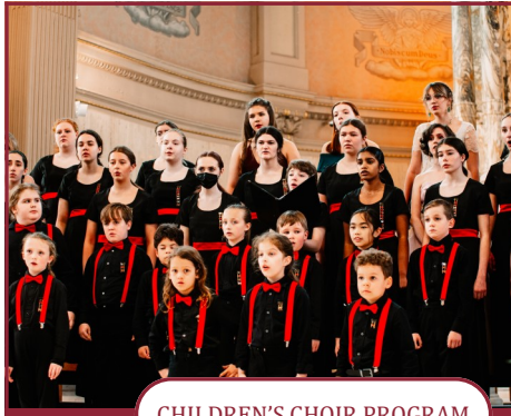
CHILDREN'S CHOIR PROGRAM

The Children's Choir Program is a leveled musical arts education and performance program for children in grades 1-12.