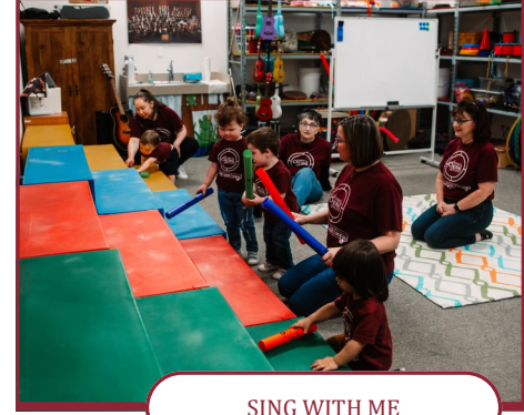
SING WITH ME

The Metropolitan Chorus is a traditional choral experience focusing on intimately-performed works.