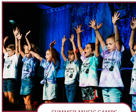
SUMMER MUSIC CAMPS

DrumSing is an innovative hybrid musical experience for high school age youth and young adults, combining traditional drumline with vocalized melodies.