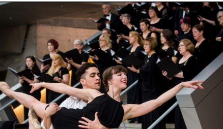
Tapestry of Songs