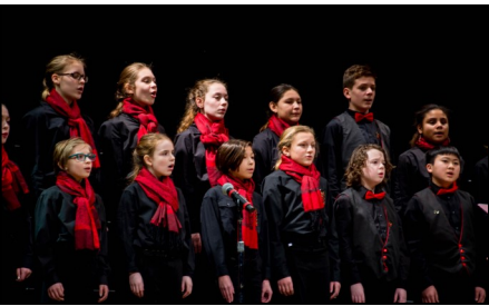
A Concert for the Holidays