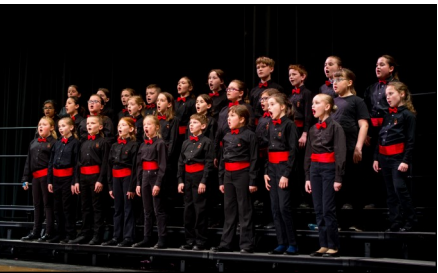
Sounds of Spring