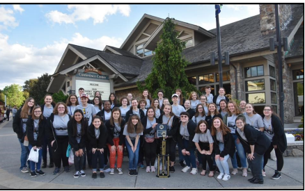
Performance Choir Education Tour