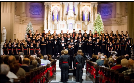
Christmas Candlelight Concerts